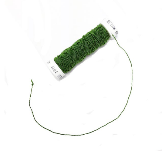
Illustration No. 1

Step 3: The thread can be couched with Au Ver à Soie, Soie 100/3 or a single ply of Au Ver à Soie, Soie de Paris. (See list below for list matching colors.) A Crewel #10 needle is recommended. You will find it helpful if the couching thread is waxed for control.